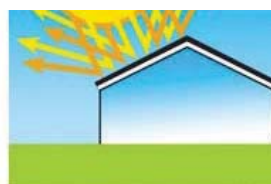
Oriplast Reflex surface